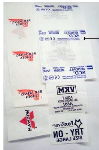
Content and care labeling